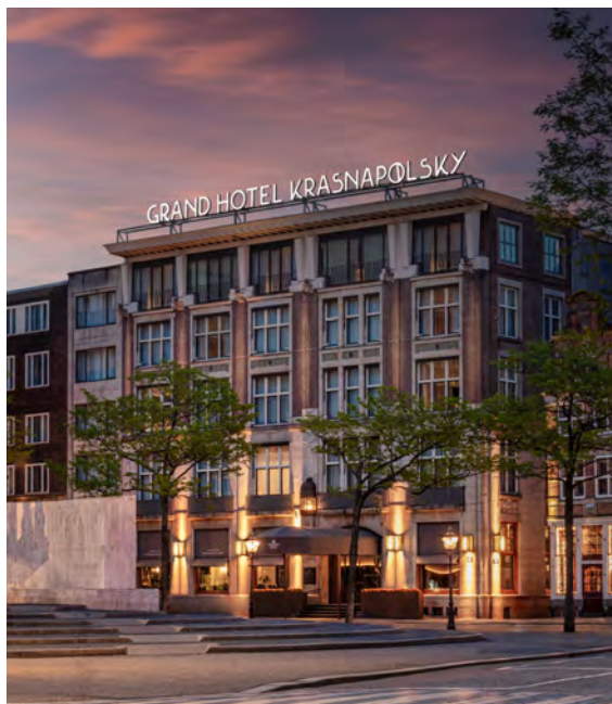
Anantara Grand Hotel Krasnapolsky Amsterdam