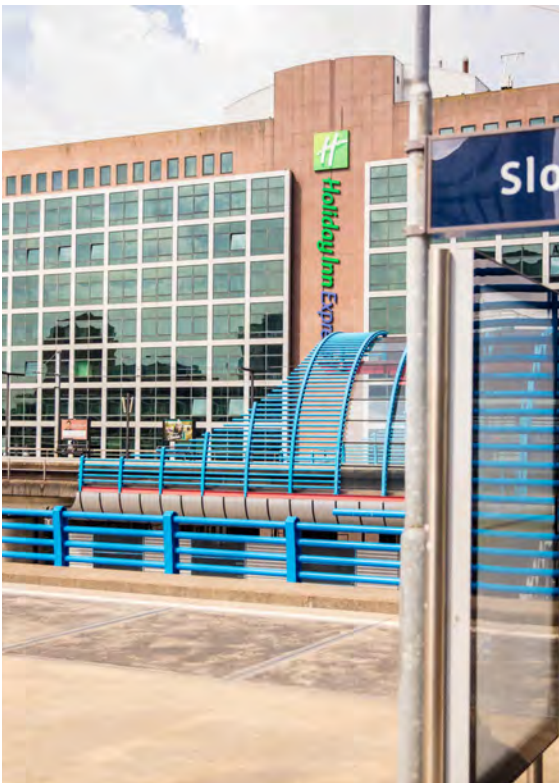
Holiday Inn Express Amsterdam Sloterdijk Station

Situated in the city centre, the Kimpton De Witt emphasises a sustainable approach to hospitality, featuring locally sourced food, non-toxic cleaners and organic bedding within a stylish, boutique setting.