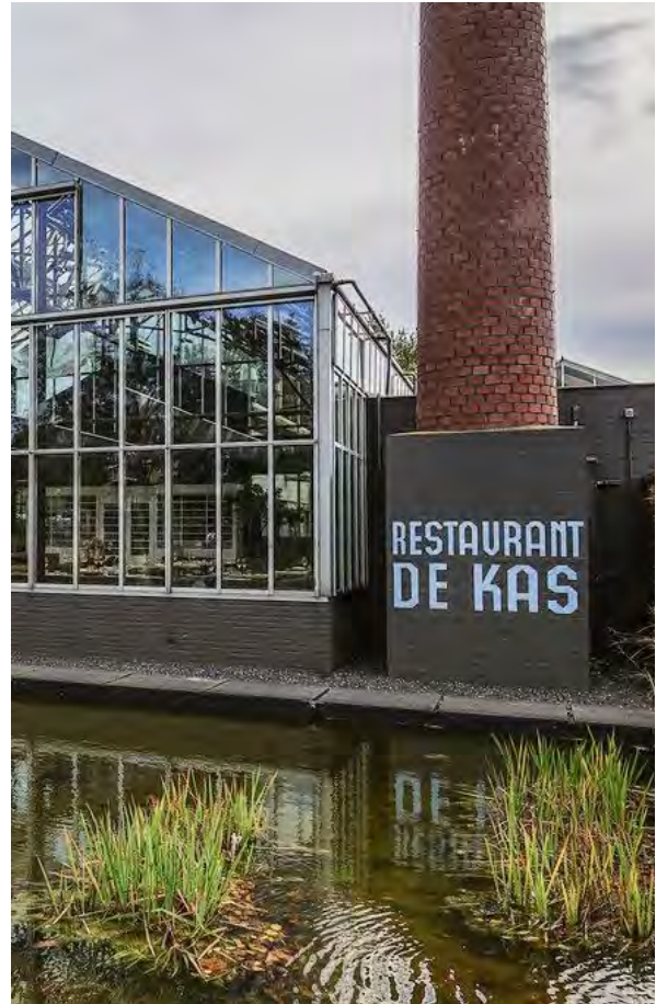
Restaurant De Kas

Vinkeles - Set in a historic bakery at The Dylan Hotel, Vinkeles is a Michelin-starred restaurant that offers a unique blend of classic and contemporary styles, serving French cuisine with a modern twist.