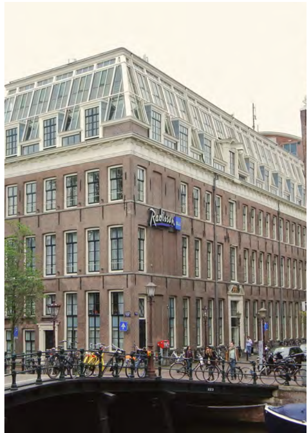
Radisson Blu Hotel, Amsterdam City Center