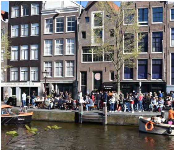
Anne Frank House

Countless boutiques and galleries - offering local arts and crafts.