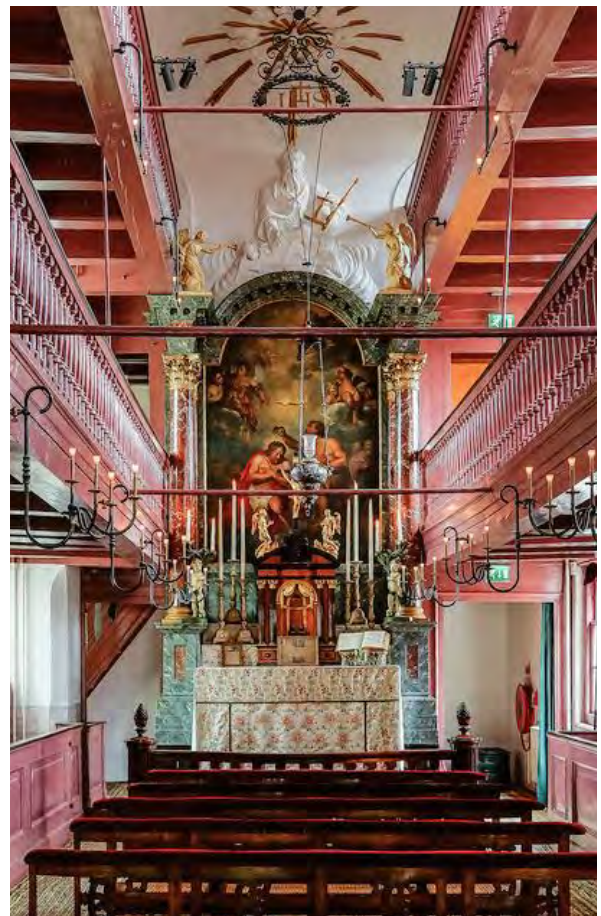
Ons' Lieve Heer op Solder (Our Lord in the Attic)

Rare exposition of an aristocrat's private collection of valuable 17th century artworks.